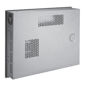
▲ Less screw design