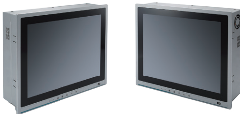
▲ Side view