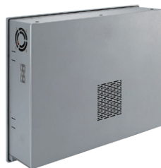
▲ Back view